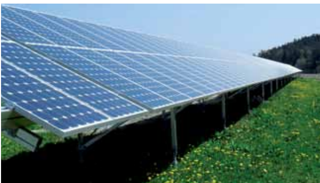
1 MW, Wirbenz, Germany

Jetion modules are particularly employed where long-term profitability, reliability and environmental issues are of great importance.